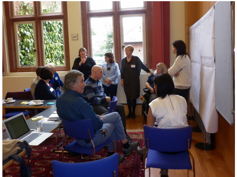
Workshop participants in deep discussion